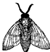
Figure 2: A sample black and white graphic (.eps format) that has been resized with the epsfig command.

placement of the table here with the table in the printed dvi output of this document.